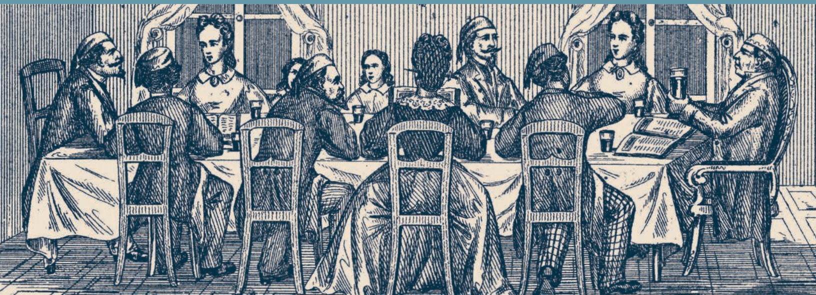
EXHIBIT GALLERY MARCH 7 – JUNE 30, 2016