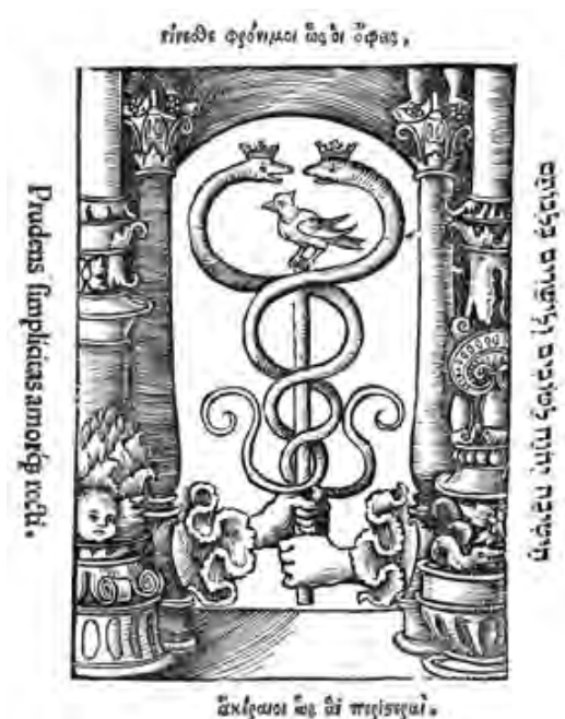
1519 BIBL V2

“Especially welcome also to Froben, a man to whose printing-house the study of Holy Scriptures owes more than to any other.”