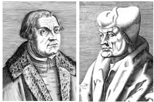
PORTRAITS OF LUTHER & ERASMUS FROM 1602 VERH

"If only Luther had taken my advice... I shall not become mixed up in this tragic affair.. I would be happy to be a martyr for Christ, but I cannot be a martyr for Luther."