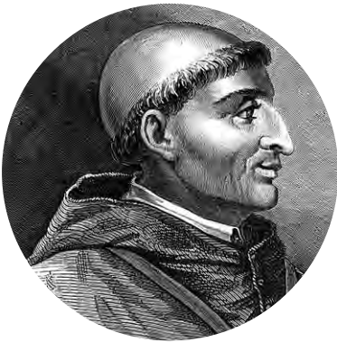
"EL CARDENAL JIMÉNEZ DE CISNEROS." EL MUSEO UNIVERSAL 1 (30 MAY 1857): 77.

Cardinal Ximenes de Cisneros (1436-1517) founded a university east of Madrid, in a place called (in Latin) Complutum. The school was dedicated to the study of the three biblical languages (Hebrew, Aramaic, and Greek), and in the summer of 1502, Ximenes endeavored to produce a Bible printed in multiple languages, drawing inspiration from Origen's Hexapla (third century CE). He spent great sums of money purchasing Greek and Hebrew manuscripts and hiring a team of editors. Printing of the New Testament was completed in January of 1514, making this Complutensian Polyglot the first printed Greek New Testament. The project was suspended before formal publication of this work, however, and Ximenes died in 1517. The entire stock of printed sheets remained in Complutum, unpublished. Four years later, in 1520, a commendation was sent by the Pope to Complutum (which was added to the end of volume 1), and the polyglot was bound and released for publication between 1520 and 1522. In the intervening years, Erasmus and Froben produced the first and second editions of their Greek New Testament, making Erasmus' the first published Greek New Testament. Scholars debate whether Froben and Erasmus knew of the work in Spain and thus hurried their work to market. In April 1515, Froben wrote to Erasmus and encouraged him to hurry his production of a Greek text, warning that if he did not, another would.