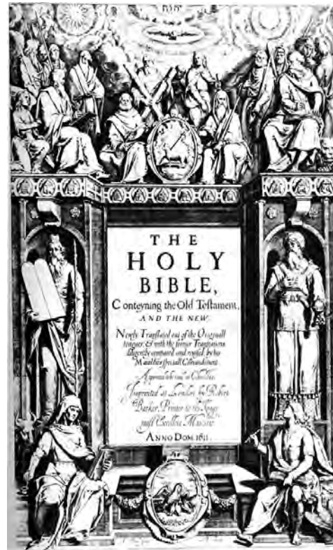
TITLE PAGE FROM THE KING JAMES BIBLE