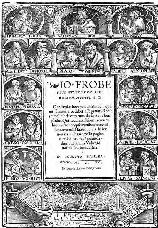
TITLE PAGE FROM KESSLER 1520 ERAS F