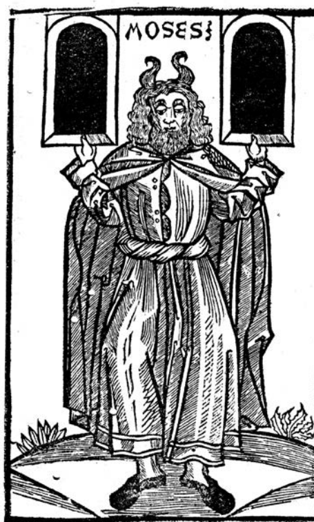
1518 LUTH D