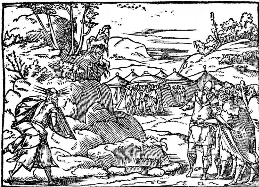
1558 BIBL C