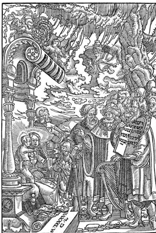
1527 BIBL B