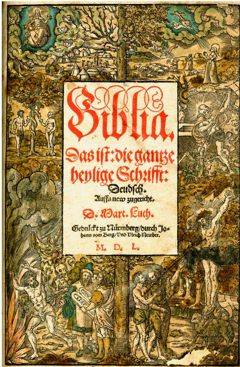
1550 BIBL B